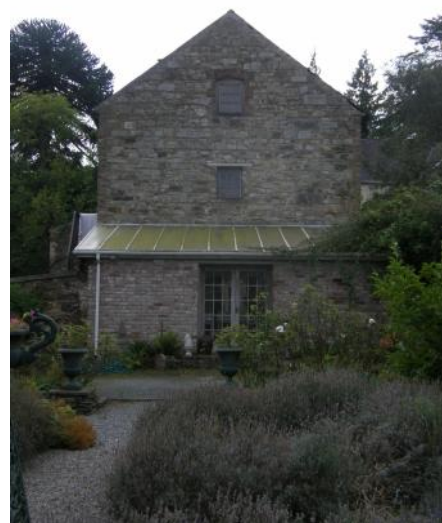
Fairbrook Mill, converted to private residence with extensive re-landscaping – adaptive reuse which has retained the integrity and character of the original complex with minimal intervention