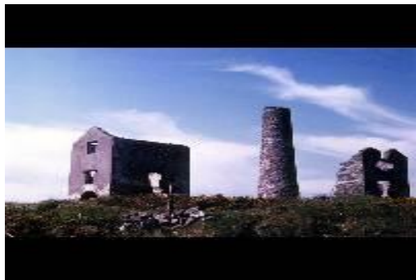
Knockmahon Mines, Copper Coast, Co. Waterford