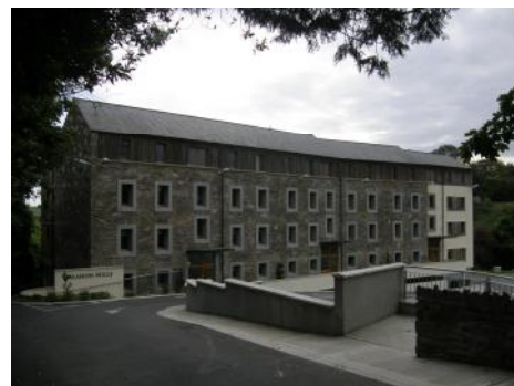
Refurbished mill complex at Kilmacthomas – lost of internal and external character due to the proposed reuse and alteration into multiple apartments.

Development proposals for redundant industrial sites entering the planning process for the first time can now be requested by the Local Authority to be fully recorded as a prerequisite of planning thus providing the opportunity to deliberate upon them in a wider county context as the overall significance of a site can be determined based on the National Inventory (NIAH) Criteria denoted as part of the survey. Sites of particular significance can be planned for accordingly and using the mechanism of scheduling sites as a 'protected structure' and adding them to the Record of Protected Structures will assist their future conservation in accordance with the Planning and Development Act 2000 and the statutory