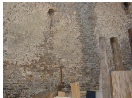
Coolfin Brick Kiln, West of Portlaw

The cut off date of 1700 for the inclusion of archaeological sites deemed worthy of study and preservation under the National Monuments Act tends to be problematic as it is an artificial timeline at best, which can exclude specific activities from proper recording and consideration. Industrial activity spans the Bronze Age to the 21 st century in Ireland. Whereas, the Industrial Age in Ireland was relatively short lived extending through the C18th to the C19th, was on a much smaller scale compared to Britain and had an agricultural emphasis due to the natural resources available.