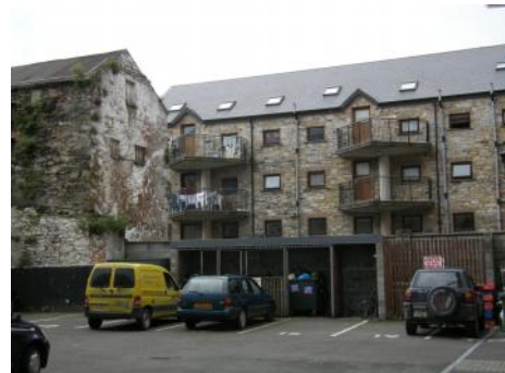
Harbour Mill Dungarvan A mixed use scheme comprising of open plan gallery spaces at ground floor level, with multiple apartments over. Adverse impact of 'add-on' balconies and the enlargement of original openings.