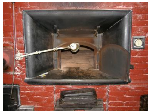
Scotch Oven – Barron's Bakery A rare industrial site that has remained in continual use since establishment in 1887