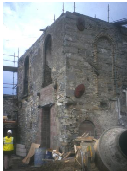
Prior to Conservation

In adaptation the importance of retaining the character and setting of the original character cannot be over stressed. The open plan nature of mill buildings and the volume of the internal space illuminated by a series of robust openings are typical and characteristics of these earlier industrial structures. Proposals for reuse need to be able to retain these features and the existing structure of