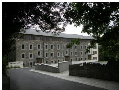
Kilmacthomas Corn Mill Waterford County has entailed the large scale re-facing of the building. Many of the associated features have been retained and add to the aesthetic its new use.

The creation of new living accommodation within previous industrial complexes can also have adverse impacts on the setting of the structure. Many sites would have quite small or narrow entrances through archways or along narrow laneways. The parameters of Current building Regulations may require improved access to enable fire tenders to turn. Most developments require a car parking space per unit provided. The