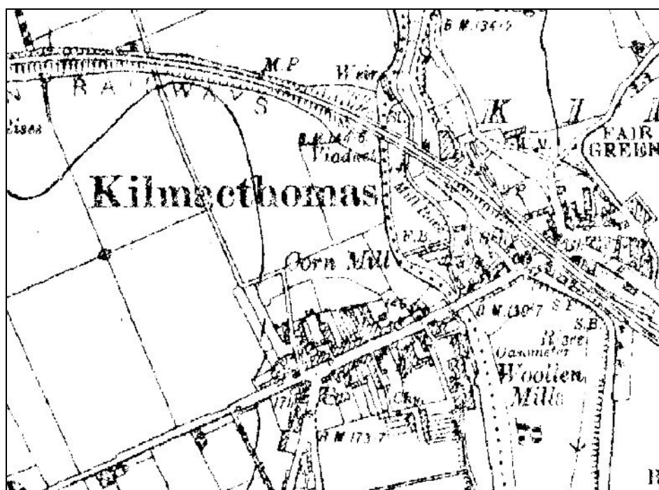
Ordnance Survey Map of Kilmacthomas, showing Corn and Woollen Mills, 3 rd ed., 1927

138 site visits were made over 12 days in the summer of 2007. Because of the growth at that time of year, many of the sites were overgrown, ivy clad and hindered comprehensive access to all areas of a site.