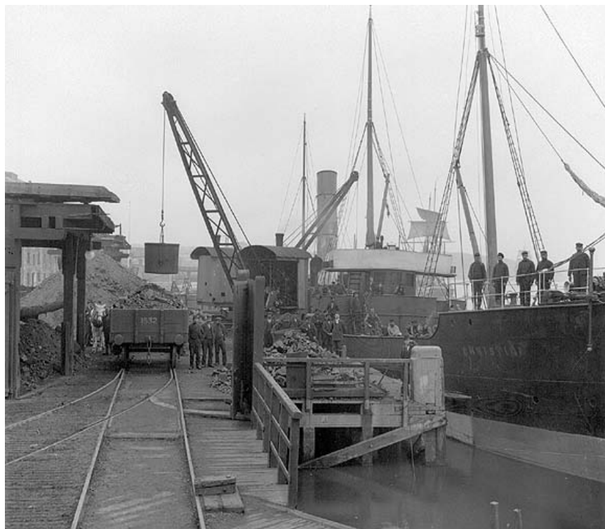
Loading coal onto 'Christina' boat, c.1910, Ferrybank Quay, Waterford