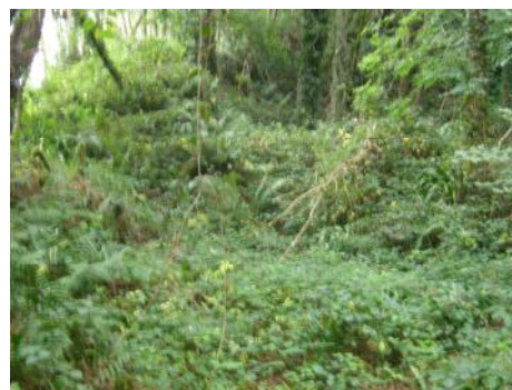
Salterbridge Mines as part of the Salterbridge Demesne – its past activities buried beneath dense vegetation

The county's past industrial efforts appear to have been initiated by powerful landlords and then driven by the early C19th industrialists, focusing mainly on milling activities and the exporting of produce to Europe and the markets of the new world. Access to the sea appears to have been an overriding concern in the location of new industry during the C18th and C19th for these early industrialists and Irish industries tended to be concentrated within the environs of ports. The standing remains of these sites, the towns, which were built and the housing provided for the workforce are intrinsically linked and should be considered as the primary record of the human endeavour and enterprise undertaken at the time.