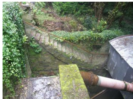
Pouldrew Mill – extant waterworks have been adapted to provide hydroelectricity