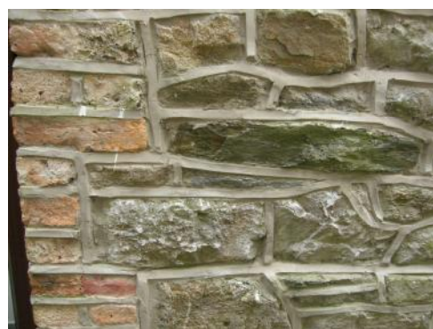
Loss of character and altered external appearance due to the use of inappropriate materials in repairs at Harbour Mill, Dungarvan