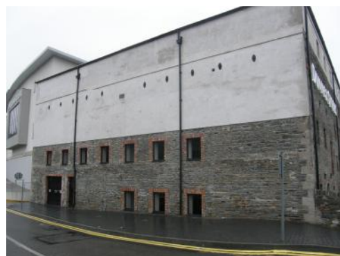
Conversion of mill site in to car park in New Ross. Little room has been left for reversibility as all interior has been altered structurally and upper elevations has been de-fenestrated.

An unusual planning file arrived into the Conservation Office on a site in Donore Avenue off the South Circular Road in Dublin of a ruined tower. A quick review of the historical mapping suggested that the structure in question was a castle and a recorded monument in the Development Plan. However a site visit proved that this was a case of mistaken identity, that the castle was previously removed and that the standing stone remains was in fact a mid C19th Steam Beam Engine House associated with the Pim Family Linen works. The value of having an architectural overview of the significance of the structure indicated that this was one of two surviving examples of this building type, the other been in a better state of preservation in County Cork. The owner of the structure was hoping to develop a corporate headquarters immediate to the ruined structure, without addressing the precarious condition of the structure. The pre-planning process and the acquisition of additional conservation skills encouraged the full restoration of the Steam Beam Engine House as an intrinsic part of the overall corporate Headquarters as the main entrance, conference facility, providing a unique corporate identity