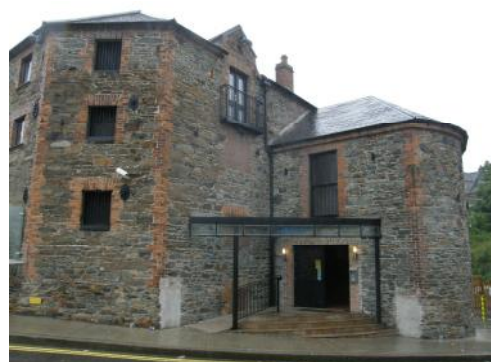
Adjacent mill site in New Ross has more appropriate function. Hotel function allows reversibility and versatility with remodelling to current use.