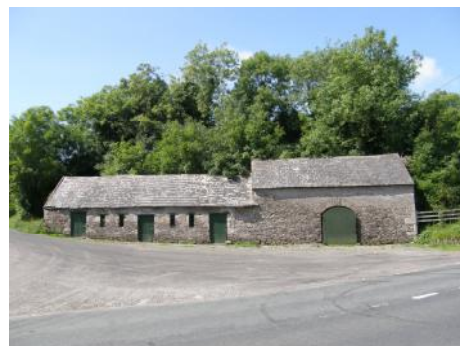
Halfway House Forge and Stables, Drumgorey – a surviving forge with ancillary outbuildings as a landmark in the midst of the county's road network

Waterford. The Gunpowder Millis at Ballincollig Co. Cork, comprising of 435 acres, is considered the largest industrial archaeological site in Ireland and the second largest of its type to have been constructed in Europe, a factor, which influenced its conservation and presentation as a major tourist attraction. For the most part many industrial sites in County Waterford appear to have survived due to lack of hitherto economic pressure. The region has been fortunate not to have experienced the burden of rapid development wrought by the 'Celtic Tiger' which has profoundly changed the use of both land and settlement patterns in commuter counties around the Dublin hub. County Waterford's remoteness from the pressures of the metropolis in this instance has ensured that the integrity of much of its built heritage has remained undiscovered and for the most part preserved in-situ in various stages of decay.