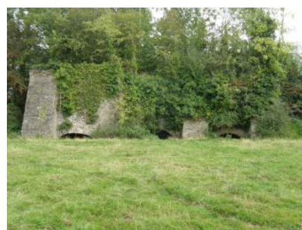
Rocketcastle – lime kiln The inventory has also allowed for the first time comparison to be made between individual sites.