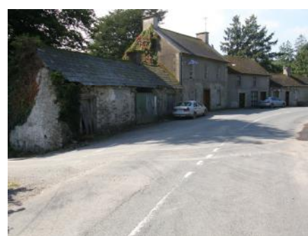
Millstreet Creamery This typology was previously not well regarded or understood as part of the industrial past. It is a core building common to many towns and villages in the county and central to working life.

The specific study of industrial sites was not undertaken to any great extent until the 1970's, most notably by An Forbas Forbatha. In the following years, some planning authorities commissioned studies of their own, such as Co. Kilkenny and Co. Dublin. It is estimated that over 100,000 industrial sites have operated in Ireland at various times with less than 5% identified and recorded (Hammond & McMahon, 2000). Specific interest areas such as the railways and canals were given special regard, and numerous successful restoration projects have been achieved due to these early initiatives. However, the other areas of our collective industrial past were not so well served and the small societies established during the 1970's did not manage to raise the enthusiasm or support to gain momentum for this topic. Since 1996 the Industrial Heritage Association of Ireland (IAHI) has actively promoted appropriate standards of surveying, conservation best practice and the development of government policy for the preservation of the country's industrial heritage.