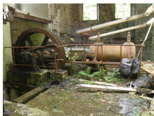
Redundant Machinery left to decay, ruined industrial complex at Portlaw