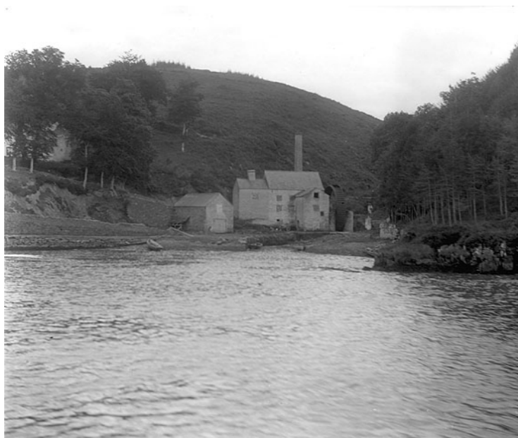
Cooneen Mill & Quay Complex, c.1910

economic activities. Although no central industrial zone was identified a number of ovens and kilns relating to various activities have been recovered. "A range of size and function of kilns are represented: limekilns, drying kilns, clay pipe kilns and possibly smokehouses" (Hurley, M.F & Sheehan, C.M 1986-92, 274). Hurley and Sheehan also suggest that one kiln which pre-dated the 15 th century was possibly used to supply materials to the construction of St. Peter's Church which was built in the 12 th century.