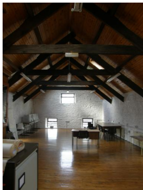
Nora Herlihy Enterprise Centre, Tallow

Other observations worth noting about the Kilmainham Mill case was the issue of the redundant machinery left as part of the weaving process. These were assessed by a specialist in this area and identified as part of the various processes undertaken at the site. They were proposed in general to be preserved by record only and sample looms set aside for special consideration as part of the future development. However, a difficulty that was not anticipated was the protracted time from when the mill finally closed up shop to the completion of a design for the mill complex. During the Design/Planning process there was a marked deterioration in the historic fabric and the issue of vandalism and security from accidental fire etc was a large problem. Constant presence on the site was essential to the historic fabric surviving the on-going threat from vandalism. However once the manufacturing processes came to an end and the use of the structures lapsed there was a marked deterioration in the fabric of the structures as well as the machinery, particularly in areas where chemicals and water have been in constant use. Where industrial buildings are becoming redundant there earlier the significance of the machinery can be identified and proper management put in place to preserve them the more successful outcome is achieved.