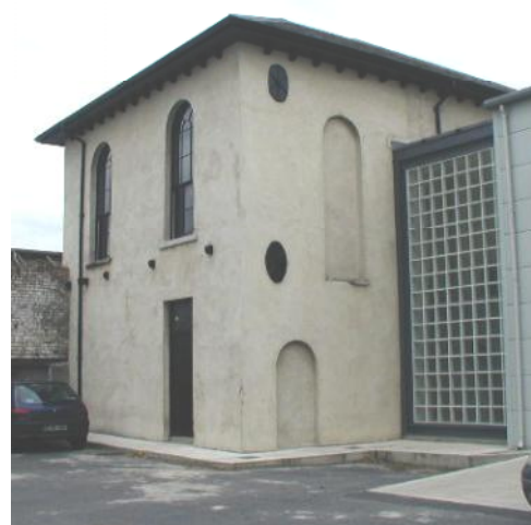
Donore Castle – former steam engine house