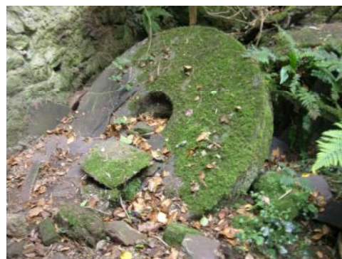
Redundant Machinery; mill wheel at Nicholastown Mill. In general insufficient information about industrial processes or activities in the county. Very few mechanised buildings have survived.

All of these planning mechanisms noted above need to be enshrined in the future planning policy of the county development plan as the first step in safe guarding the industrial heritage sites. The database from this survey needs to be regarded as a dynamic database of the county's assets, to which access must be provided to all parties involved in the planning process. The focus of the industrial heritage survey as commissioned by Waterford County Council had a specific time frame requesting structures, which fell during the period between 1700 and 1923 to be reviewed. This has specifically exempted all C20th industrial structures from consideration and record. Experience suggests that the rate of redundancy that is over taking this more recent building period is already increasing and that these sites are becoming more prevalent for redevelopment. Many of these industries were purpose designed using innovative materials and refer to the international architectural style or movement. Some provision for the proper review of their respective significance under the NIAH criteria needs to be put in place as part of the overall