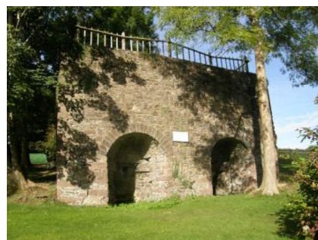
Particularly well-preserved kiln site at Halfway House Ballycanvan Little, where a cluster of industrial sites have been identified in close proximity to each other during the course of the inventory work undertaken.

The importance of the survey undertaken in 2007 can not be over stated as for the first time the Planning Authority now possesses an overview of the range of structures to be planned for, their rarity value, condition and potential. Arising from this inventory the setting up of a dynamic database, which will allow the future coordination and review of this survey material with similar thematic surveys is desirable, as it allows structures to be added, updated or detracted from the process as necessary. The recording of the sites has also been completed in line with best practice of recording sites, their functions and their machinery as established by McMahon & Hammond. Interestingly very few examples of