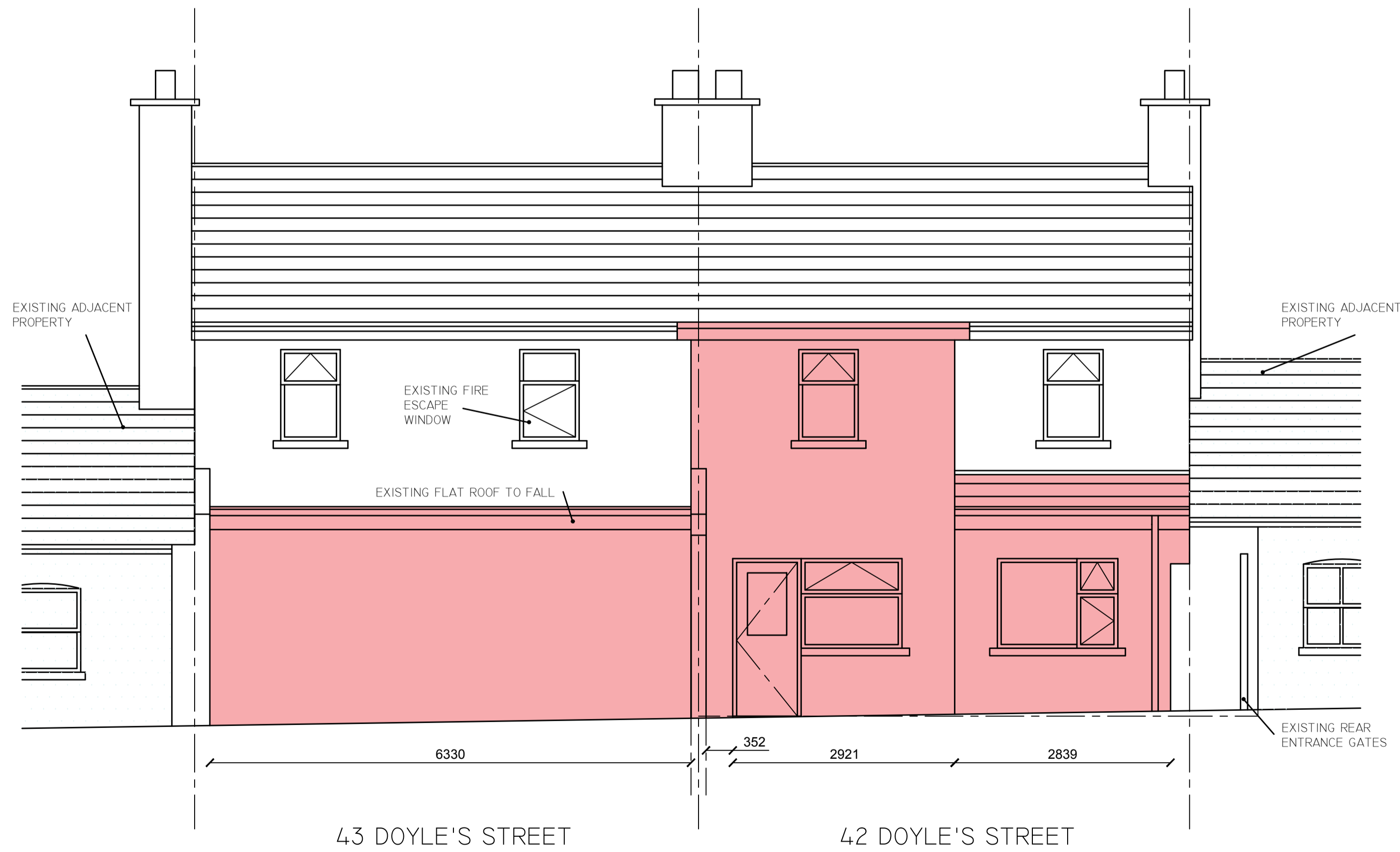
EXISTING REAR ELEVATION 1:100 @ A3 / 1:50 @ A1