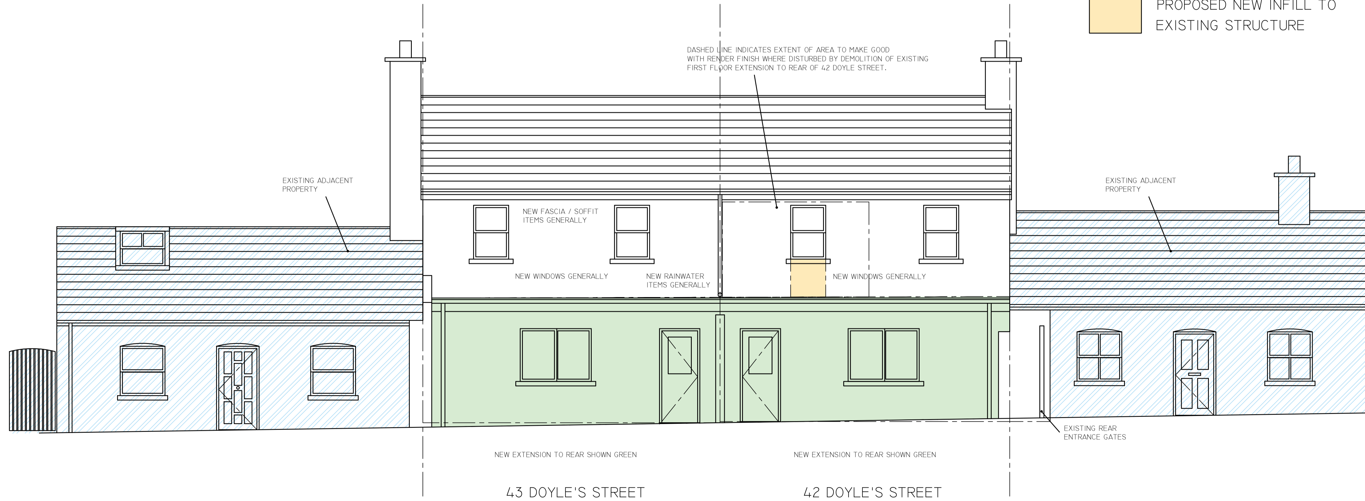
PROPOSED REAR ELEVATION 1:100 @ A3 / 1:50 @ A1